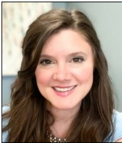
Governor-Elect Kacie Obradovich SI Tuscaloosa, AL